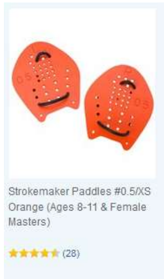
Strokemaker Paddles #0.5/XS Orange (Ages 8-11 & Female Masters)