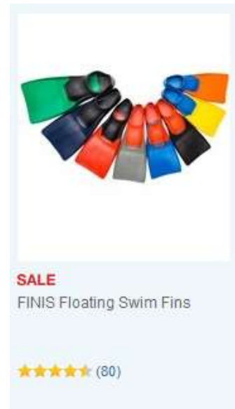
SALE FINIS Floating Swim Fins