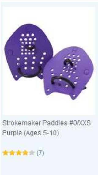
Strokemaker Paddles #0/XXS Purple (Ages 5-10)

We recommend talking to your Coach before purchasing paddles. While paddles are great for swimming if you get the wrong type, it can impair your swimming or cause injury. Lane mates might have paddles that you can try before buying.