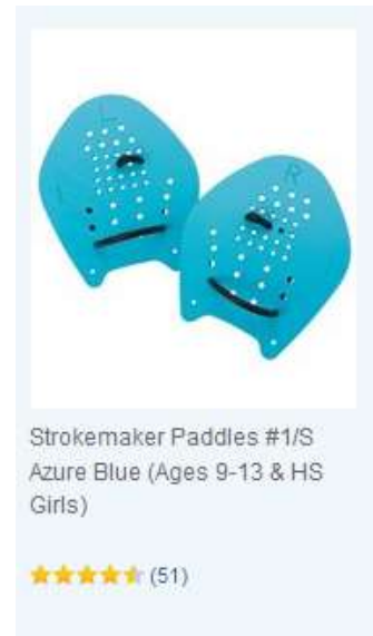
Strokemaker Paddles #1/S Azure Blue (Ages 9-13 & HS Girls)